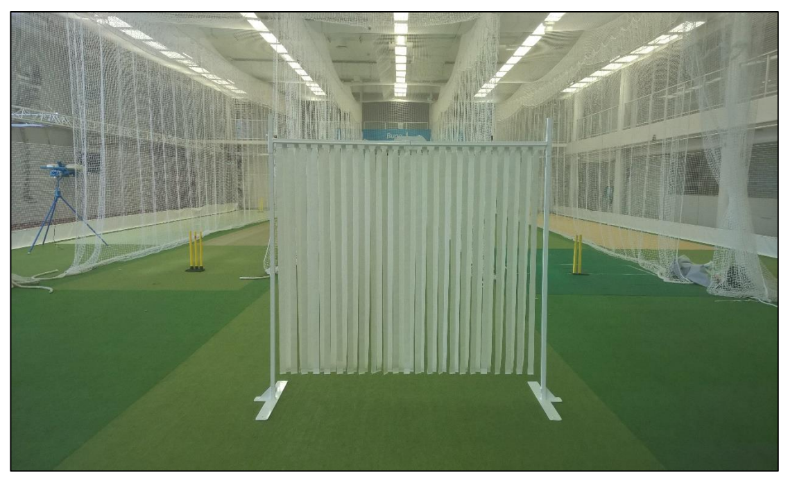
Total Reaction Screen at Australian Cricket Centre, Brisbane.

Australian company, Reaction Advantage Pty Ltd, joined forces with SAQ several years ago to develop a new concept in movement and physical activity training with a training innovation called the Total Reaction Screen (TRS). This technology was included as part of a major UK Public Health funded research project carried out by SAQ which involved over 2,000 primary school children from 14 different schools.